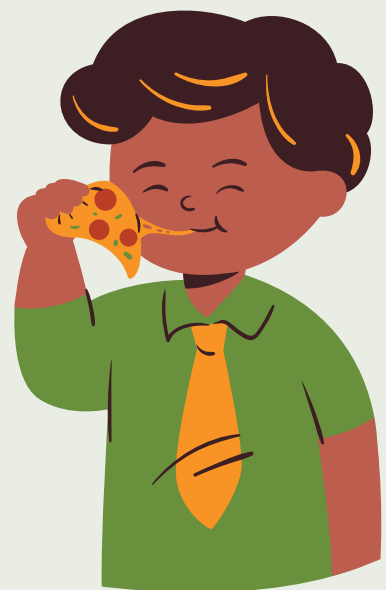
OKUS - jezik