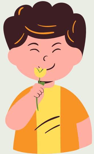
VOH - nos

Čutila so organi, s katerimi zaznavamo DRAŽLJAJE . Celice, ki prenašajo dražljaje, imenujemo ČUTNICE .