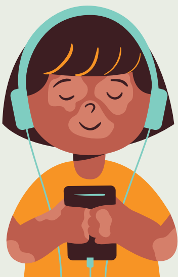
SLUH - uho